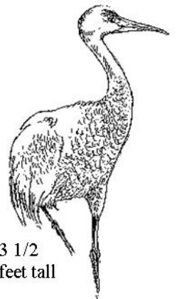
3 1/2 feet tall

For more information contact Ronnie O'Brien, 877-511-2724 or robrien@archway.org